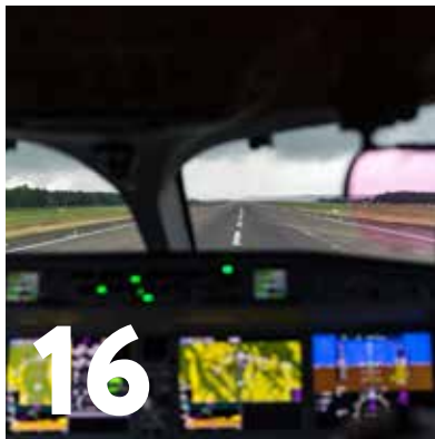
// FINAL CALL FOR ADS-B