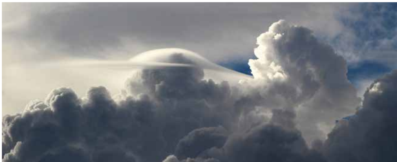
// Cap Cloud, Christchurch, May 2021.