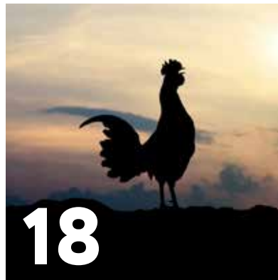
// ARE YOU A 'CROWING ROOSTER'?

Cover: Investigation and Response (Safety) Investigator Siobhan Mandich at the site of a 2017 accident. The safety team investigates the causes (including possible systemic causes) of accidents to find the lessons in them that can be communicated to the rest of the aviation community.