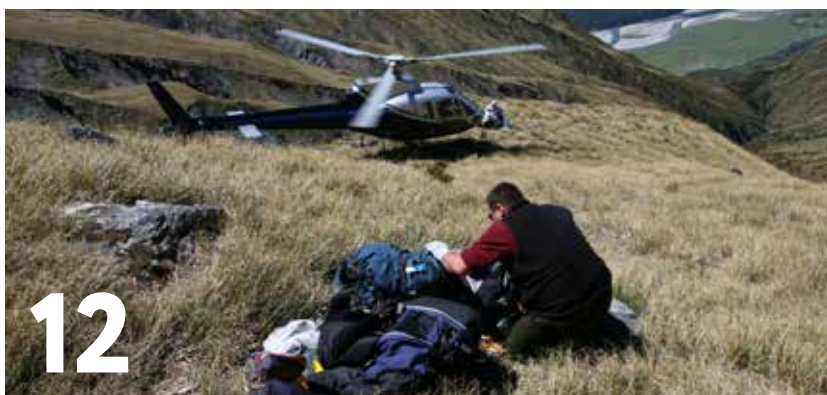
// CAA INVESTIGATIONS – BUSTING THE MYTHS