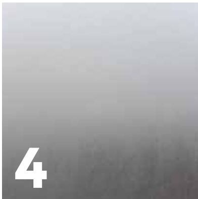
// VFR INTO IMC – PART TWO