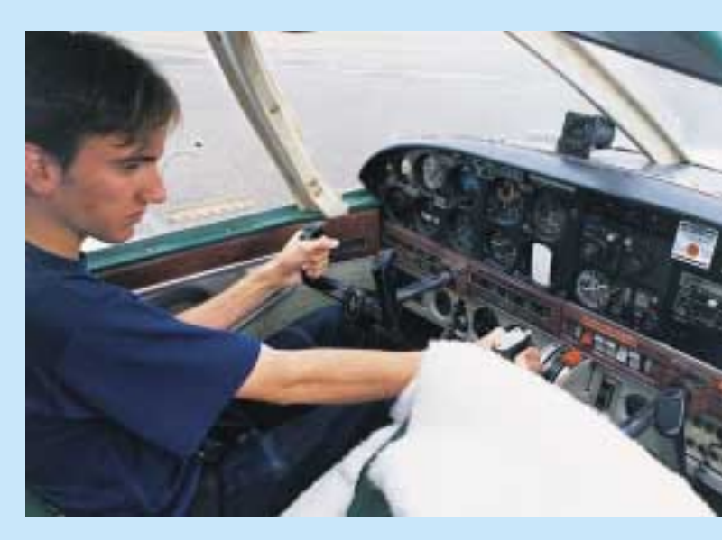
aft that control column movement will not be compromised. With respect to PA-28 aircraft, operators should check to see that the front passenger seats are fitted with a seatback latch and are locked in the upright position. ■

In order to prevent this type of occurrence, operators need to ensure that unoccupied cockpit seats are positioned sufficiently