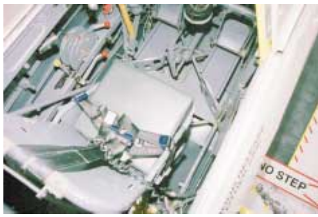
The seat cushion with the straps done up. The straps do not prevent the cushion from moving under negative G.