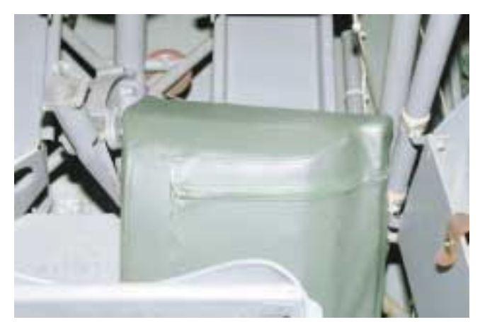
The seat cushion jammed between the fuselage and the control column stub. The rear control column is removed for solo flight. Note the angle at which the ailerons were jammed.

rear straps secured. I did not see the seat cushion in the seat pan; it is the same colour as the seat pan and would have been mostly obscured by the seat belts. I was at fault for not opening the rear canopy and physically checking the straps, in which case I would most certainly have noted and removed the offending cushion.